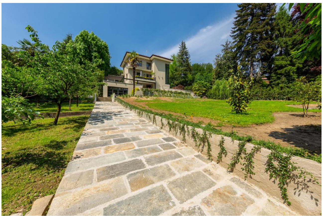
Logo\ Srl-C.so\ Vittorio\ Emanuele\ II,\ n.6-10123\ Torino\ {\bf www.logoimmobiliare.com}