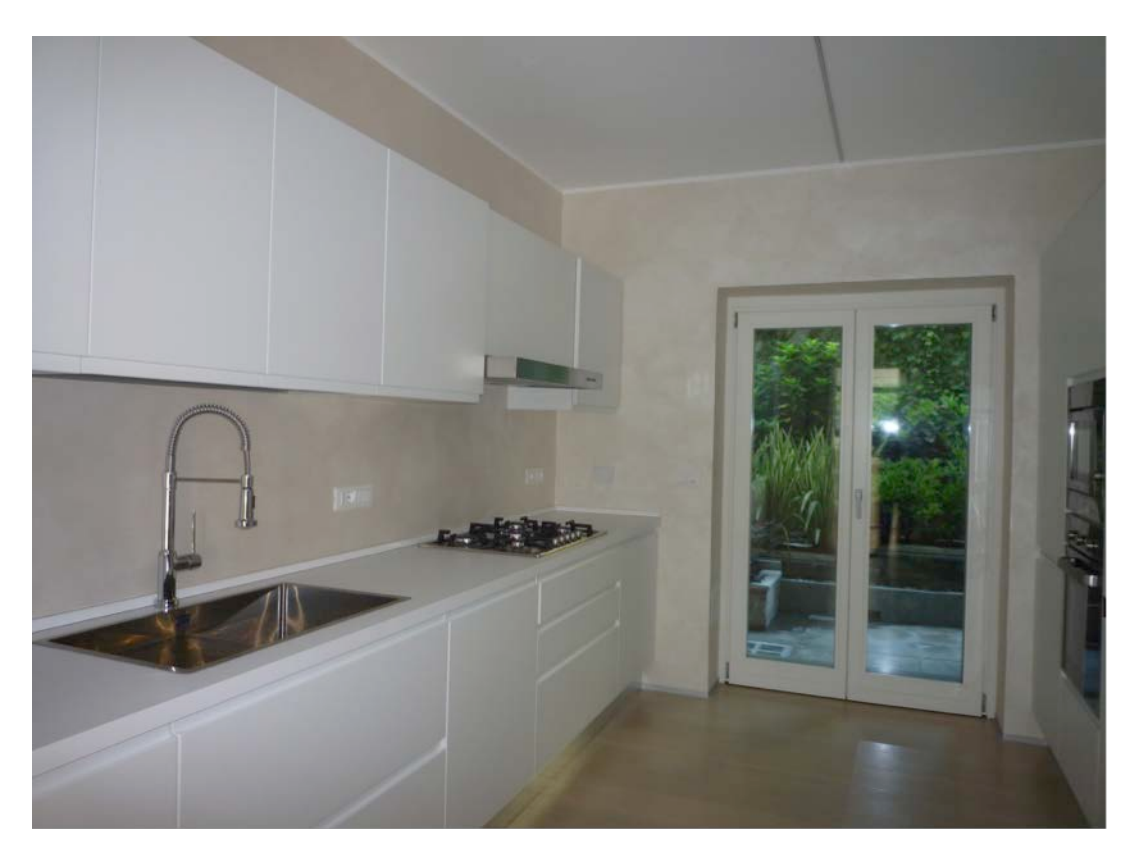
Logo Srl – C.so vittorio Emanuele II 6- 10123 Torino www.logoimmobiliare.com